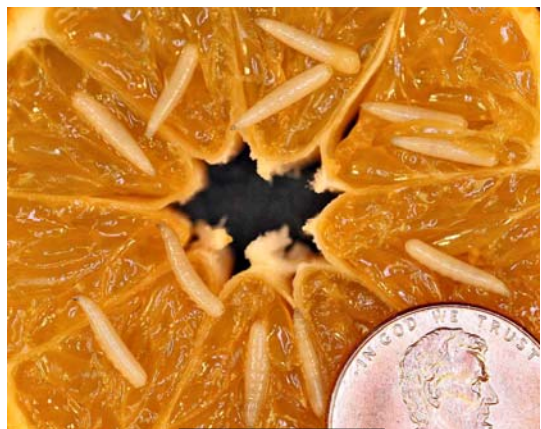
Larvae in orange

Names/Aliases: Mediterranean fruit fly ( Ceratitidis capitata ) or Medfly