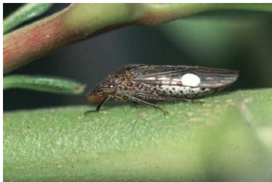
Fig. 3. Glassy-winged Sharpshooter, adult female